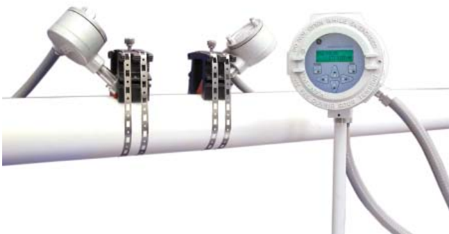
DigitalFlow XMT868i shown with clamp-on transducers

To minimize the effects of flow profile distortions, flow swirl and cross flow, and for maximum accuracy, you can install the two sets of transducers on the same pipe.