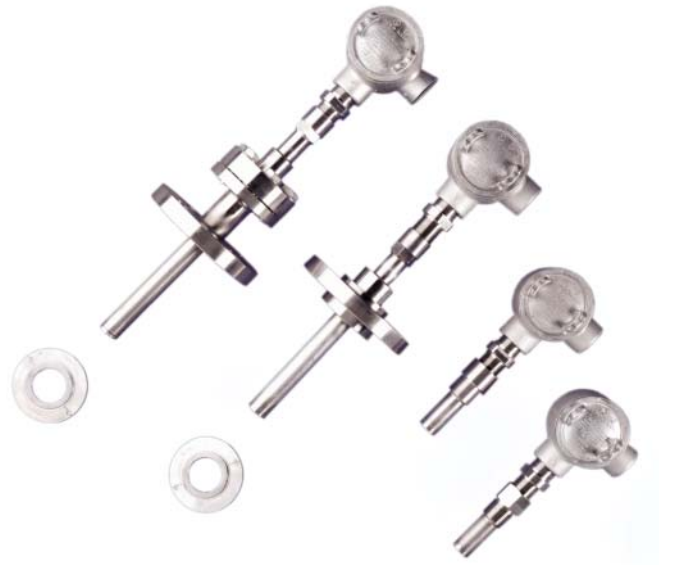
Bundle Waveguide Technology System

With the DigitalFlow XMT868i combined with the Bundle Waveguide Technology System from GE, you can measure cryogenic fluids like LNG or the demanding temperatures of coker resid lines that can run hotter than 700°F (371°C). Ultrasonic flowmeters will not cause pressure drop and have no impulse lines to plug, making them a great solution for difficult fluids. Even though most ultrasonic manufacturers' flowmeters can only handle up to 500°F (260°C), GE's BWT systems have been able to reach up to 1000°F (537°C). The unique design removes the piezoelectric element from the extreme temperatures by using wave guide technology. The transducer can even be swapped out under operating conditions. One customer has installed 16 units, replacing their wedge meters, and has had them operating maintenance free for more than five years.