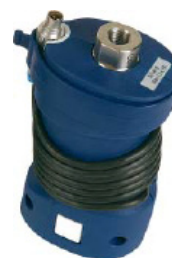
External IDOS universal pressure module