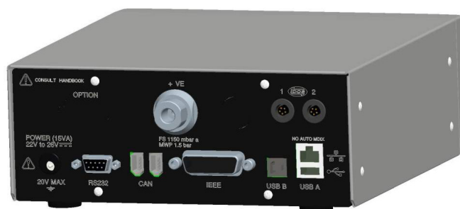
PACE1001 from the rear