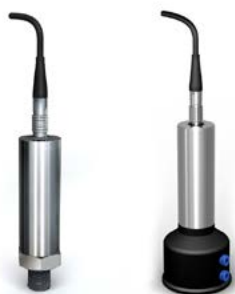
Gauge pressure Differential pressure